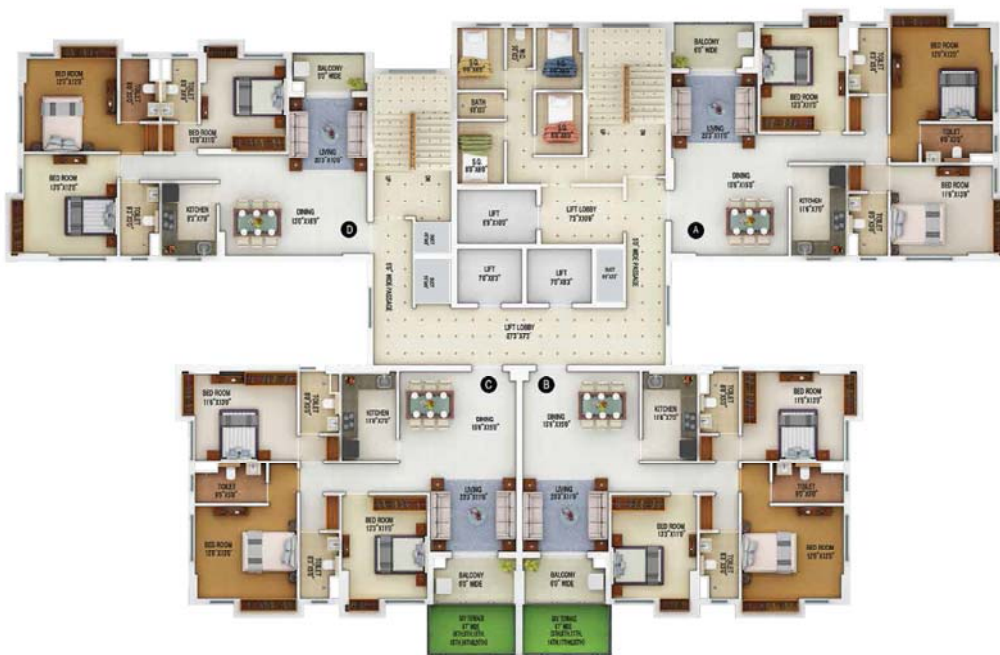
Block -2 | 5th-22nd Typical Floor Plan