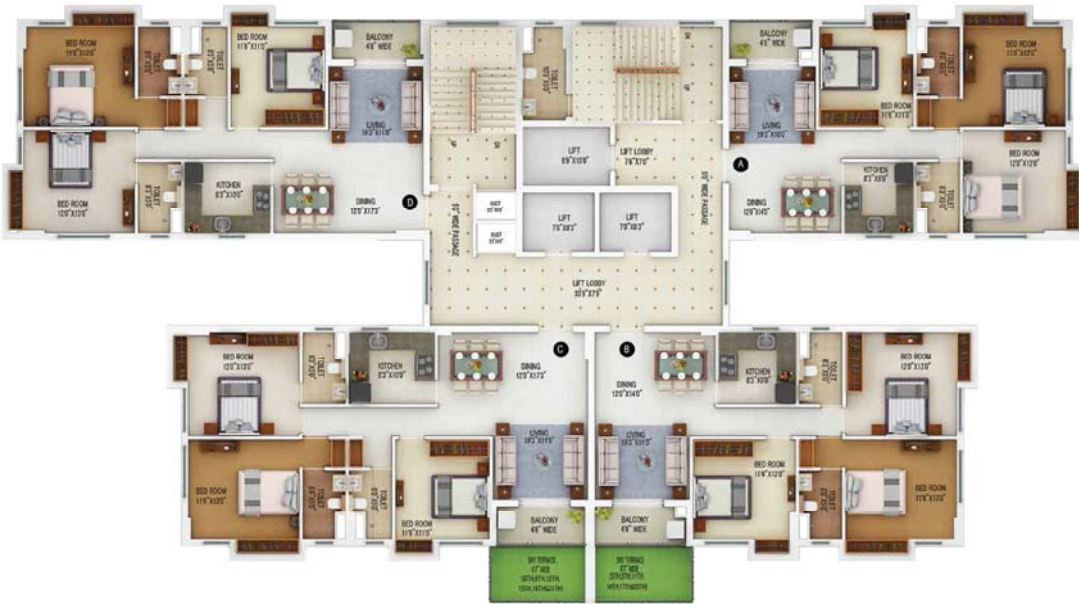
Block -3 | 4th-22nd Typical Floor Plan