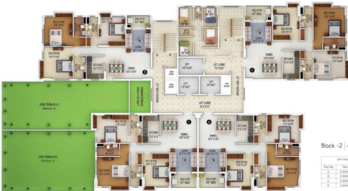
Block -2 | 4th Floor Plan