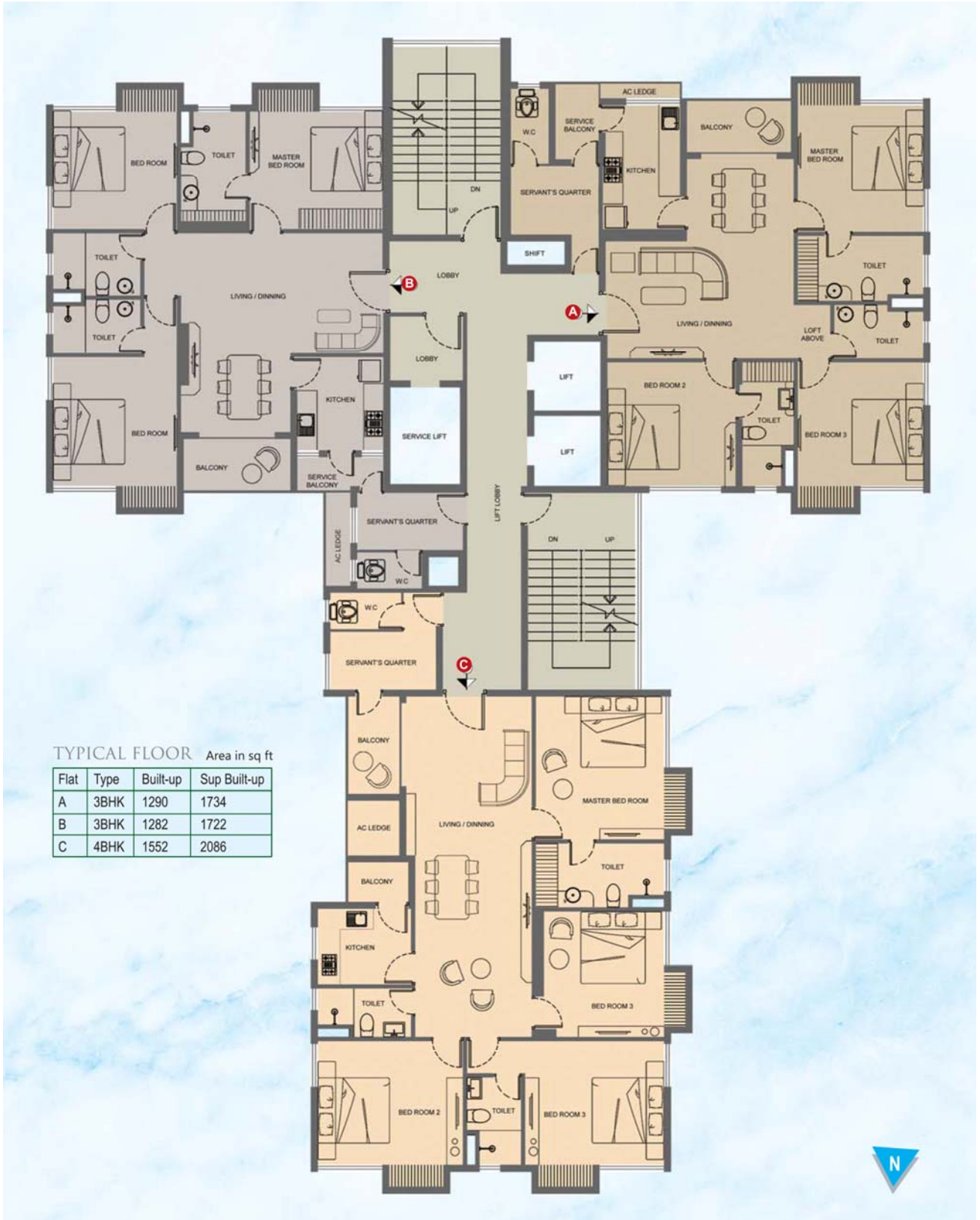
TYPICAL FLOOR Area in sq ft