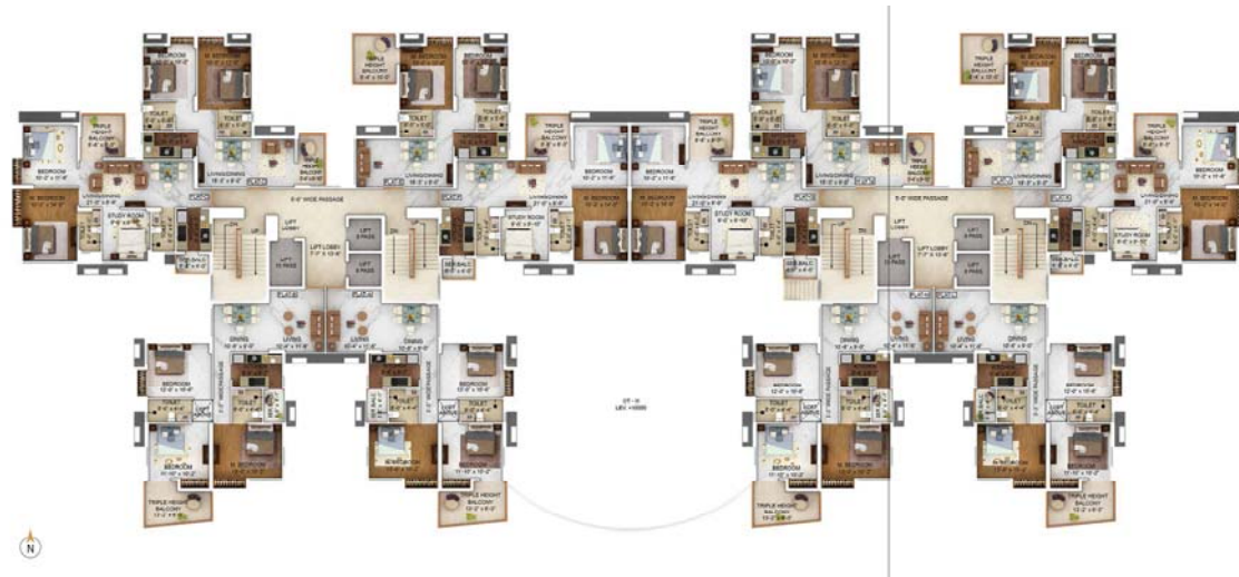
Tower 2 - 3, 6, 9, 12 & 15th floor plan