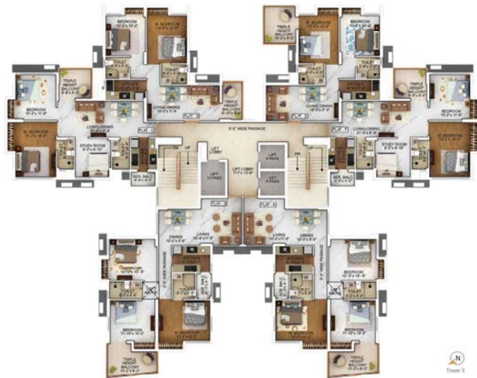
Tower 1 & 3 - 3, 6, 9, 12 & 15th floor plan